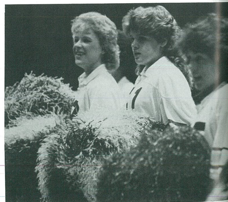
Junior Varsity Cheerleaders try to boost spirits with a black light routine during the Halloween pep rally.